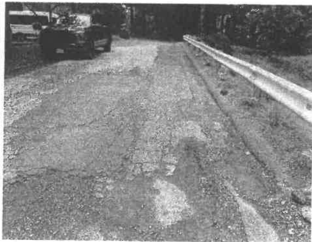
2: Existing conditions at the Stockbridge Housing Authority's Heaton Court Development. -Parking Area